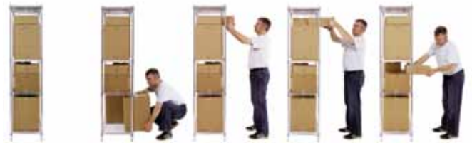
TRADITIONAL STORAGE USES UP TO 20' OF SPACE

HIGH DENSITY STORAGE... THE SMART WAY TO PUT SPACE TO WORK.